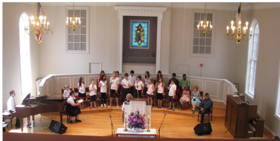
June 12 th Student-led Worship Service

Plan on coming and worshipping together this summer as we enjoy unique aspects in our worship experiences to praise the Lord!